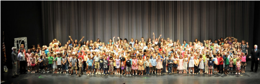
2009 Mayor's Award Winners Celebrate Their Accomplishment on August 27 at the Civic Auditorium

It was a great year for the library's annual Summer Reading Program. Almost 2,500 kids signed up, and 628 of them, from kindergarten through grade 12, completed their reading goals. An additional 300 Read-to-Me participants completed their reading